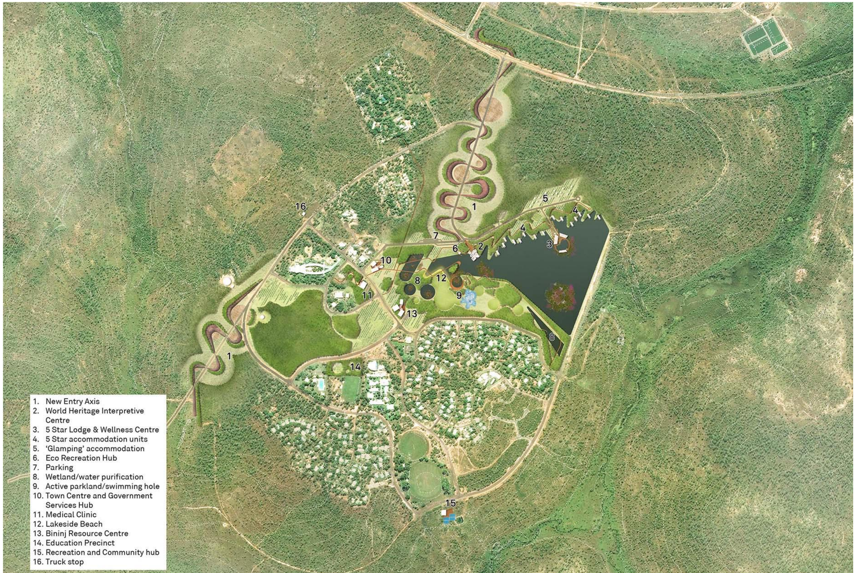
Figure 35: Proposed Jabiru masterplan with opportunities